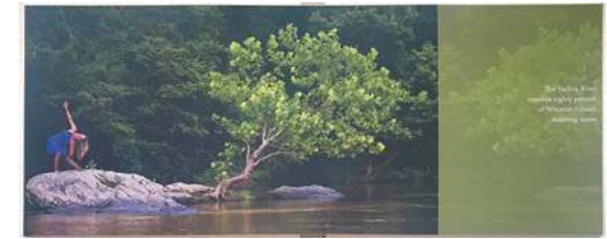
Dance for the River - Blue Dress Christine Rucker East Bend, NC

Dance for the River - Blue Dress is an image captured as part of an interdisciplinary program that brings together dance and photography to drive awareness and educate about clean water on the Yadkin River, which is North Carolina's second longest river and one of the largest watersheds in the state.