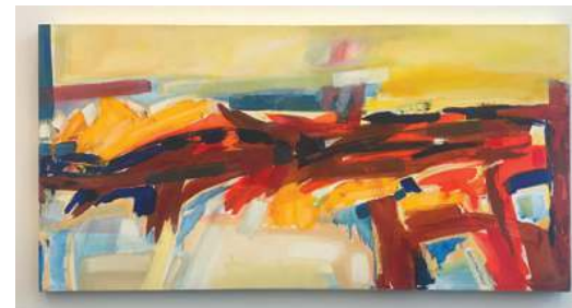
Bliss Cecilia Tellier Myrick Farrell High Point, NC

Bliss reflects Cecilia Tellier Myrick Farrell's feelings of growing up on a 150-acre farm and living with nature in upstate New York.